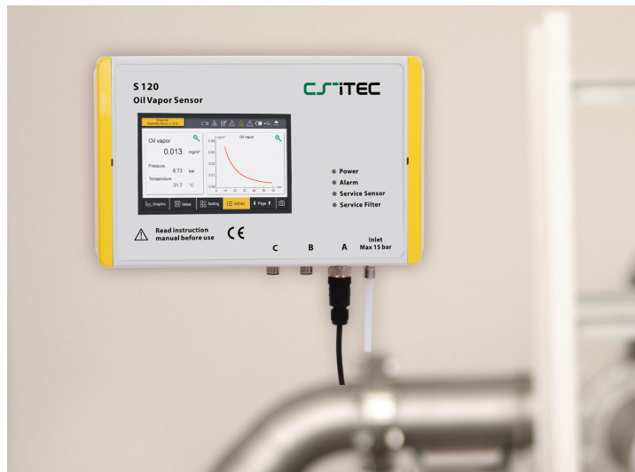
S 120 mounted at the wall for permanent oil vapor monitoring