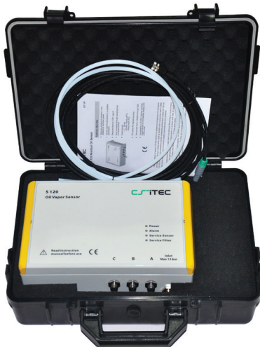
Portable S 120-P with accessories connectable to S 551